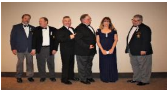
Thursday, January 17—Membership Meeting 7pm Changing of the Guard