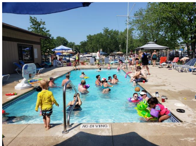
Pool Party June 29